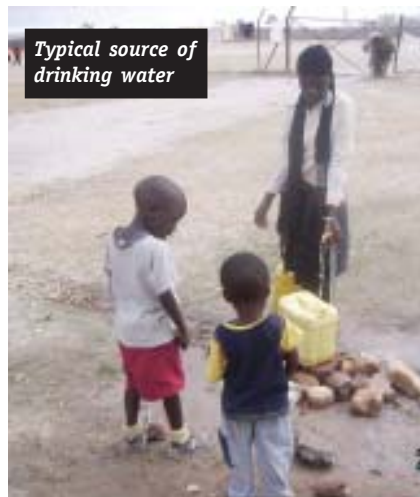
Typical source of drinking water

The participation and support of the community members in the CBMS-Zambia pilot test gives the PMT a positive headstart in the implementation of the project. *