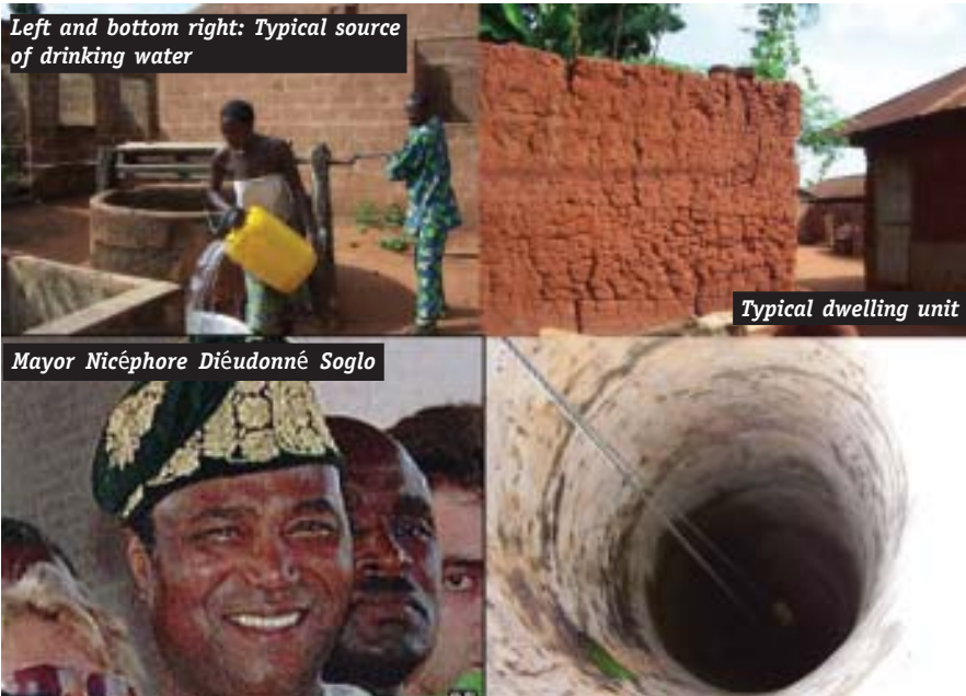
Left and bottom right: Typical source of drinking water