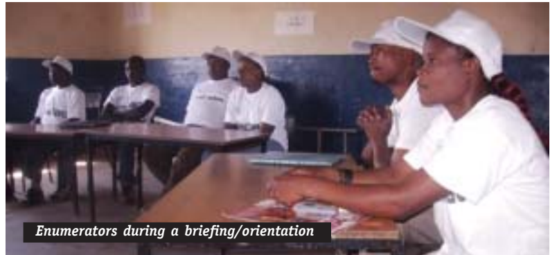
Enumerators during a briefing/orientation

The Zambia Research and Development Centre (ZRDC), the presidential office, government agencies, non-government organizations, local government units and local communities in Zambia have set the guidelines for the pilot testing of the poverty data collection project called Community-Based Monitoring System-Zambia (CBMS-Zambia) in Mungule.