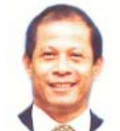
Sec. Domingo Panganiban, NAPC

aims to pool together local resources in order to have a focused and integrated strategy that would maximize the impact of programs and projects for economic and social development. At present, 32 barangays and households whose monthly incomes do not go beyond Php2,000 are being targeted.