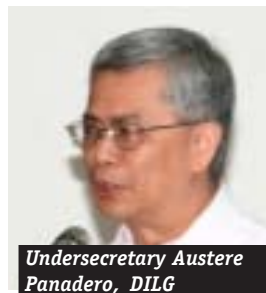
Undersecretary Austere Panadero, DILG