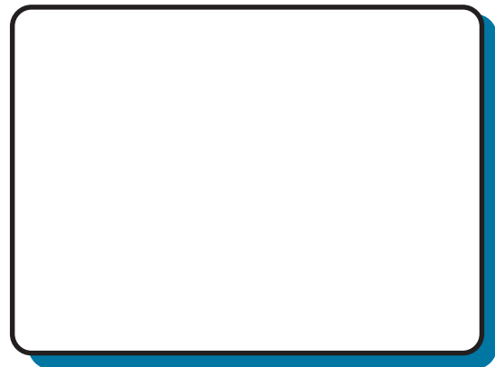
Some of the participants viewing the CBMS exhibit which showcased photos of LGU capacity-building activities and sample CBMS-generated maps showing CBMS survey results.