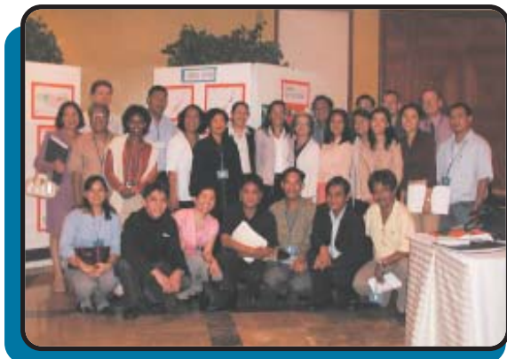
Organizers of the workshop and selected participants pose for a souvenir group picture.