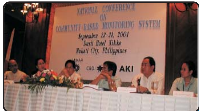
Representatives from the Leagues of Cities and Municipalities (2nd and third from right) provided comments on the CBMS presentations of Labo, Camarines Norte and Puerto Princesa City.