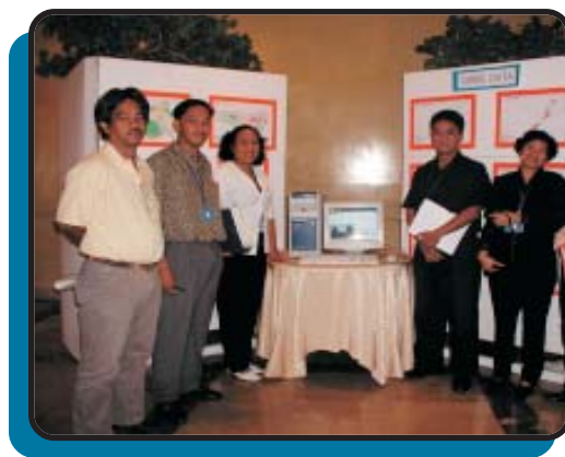
Focal CBMS partners from LGU-Camarines Norte.