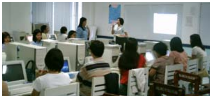
Conduct of Training on Data Encoding and Digitizing led by the CBMS Network Team and the PPDO Technical Staff held at the Bulacan Polytechnic College Computer Center last May 2005.