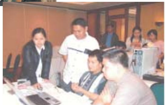
Selected staff of the City Planning and Development Office of the city of Muñoz during the training on data encoding and digitizing.