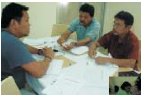
Some of the participants during training on the preparation of the socioeconomic profile (SEP) discuss among themselves their strategy in drafting their first ever SEP.