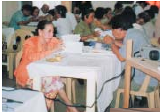
Governor Carmencita Reyes of Marinduque during the training on data collection in Boac, Marinduque.

In addition, the DILG is now in the process of scaling up the establishment of CBMS as the instrument to generate the CLPIs for poverty diagnosis and planning and monitoring local progress on MDGs. With the conclusion of the National Trainers Training for Regional MDG and poverty focal persons, the regional offices are now in full blast advocating the establishment of the CBMS at the local levels. *