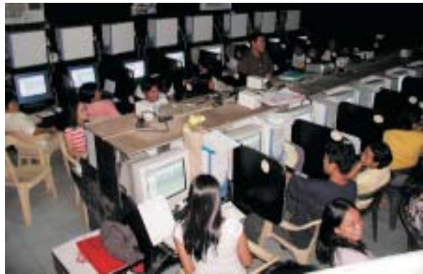
Participants from the municipalities in Palawan were provided hands-on training on data encoding and digitizing of spot maps.

This latest undertaking further enhances the use of the CBMS as a tool for planning, program formulation and impact monitoring of government interventions in the Province of Palawan which started in March 1999. It also promises to provide more useful information for the next Palawan Human Development Report . The Report , the first such report at the provincial level in the country, not only contains an updated basic demographic information about the province but also assesses the condition of Palawenos across municipalities in terms of income and livelihood, sanitation, health, nutrition, security and shelter