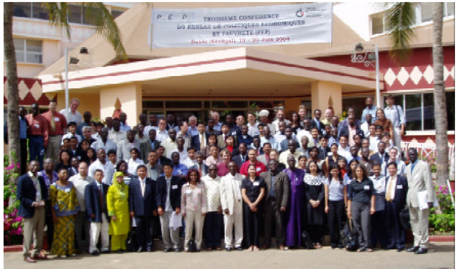
PEP researchers pose for a group picture in Senegal, this year's venue of the general meeting of the network.

This year's PEP general meeting was hosted by the Centre de Recherches Economiques Appliquées (CREA) in