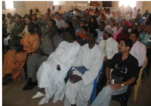
Village officials and sectoral heads/ representatives of Tivaouane convened in a forum organized for the visit of CBMS network researchers and invited policymakers in the community.