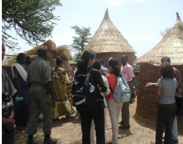
Part of the field visit of the CBMS team in one village in Burkina Faso.

The delegation was then briefed by the traditional chiefs and presidents of the Village Development Committees (VDC) who explained the activities of the CBMS in their