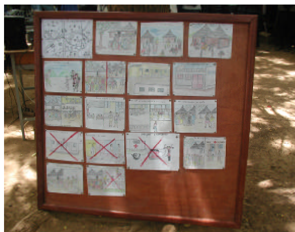
The use of drawings to show the results of the CBMS survey has made the community better understand the poverty situation in localities in Burkina Faso.

With the data produced and disseminated throughout the villages and the commune, things have started