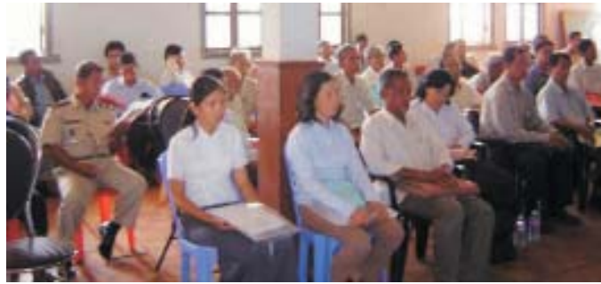
Various stakeholders gather together during presentation of CBMS.

Meanwhile, the provincial partner took part in supervising the enumerators as well as the commune council members. Members of the supervisory team car-