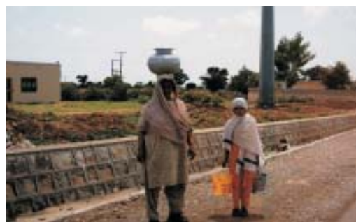
In Dhamyal village, one of the CBMS sites, females, young and old, have to walk long distances every day carrying water.

All of the households in GB42 that are getting water from outside their houses have to travel a kilometer or less while in Dhamyal, the situation is much worse, with 35 percent having to travel over one kilometer. The situation is worst in Mohra Bariyan where 13.1 percent of the households need to travel 2-5 kilometers to get drinking water.