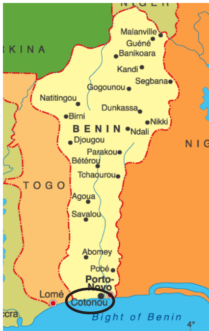
Map 1. Map of Benin showing the town of Cotonou (encircled): the location of the CBMS pilot site