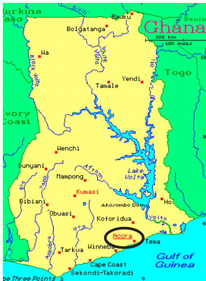
Map 1. Map of Ghana showing the Greater Accra Region (encircled): site of CBMS pilot communities