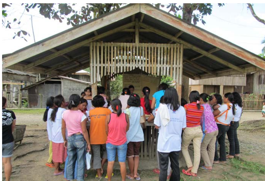
A group of women attends a Pantawid Pamilya (2Ps) meeting. The 2Ps is a conditional cash transfer program of the Philippine Government designed to help poor families.

The main objective of targeted government intervention is to reduce the deprivation suffered by the poor. Their deprivation might come in various forms. For instance, they may suffer from poor health or chronic unemployment or have a low level of education. Projects or programs may therefore be designed to give the poor greater access to various government services. However, the main constraint in designing targeted programs is the inability to identify the genuine poor. If we have the income or expenditures of individual families, then we can easily assess their poverty situation by comparing their income (or expenditure) against a predetermined poverty line. Such detailed information and administrative ability to use it is not present in most developing countries (Haddad and Kanbur 1991). In the absence of such information, targeting methods have been devised so that the poorest and most vulnerable members of the society receive the maximum benefits.