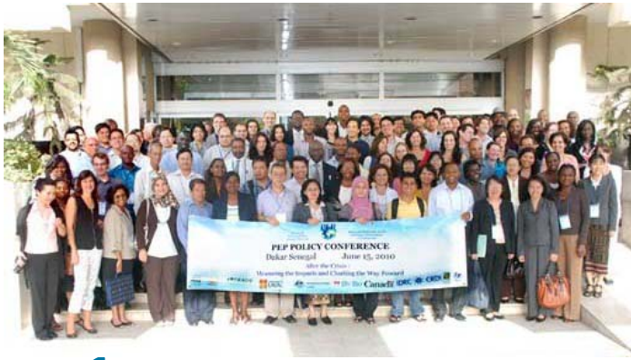
Participants of the 8th PEP General Meeting which was held on June 12-18, 2010 in Dakar, Senegal

At least 150 delegates composed of researchers, national and local policymakers, program implementers, and representatives of development partner agencies are set to converge at the Angkor Era Hotel in Siem Reap, Cambodia on December 5-9, 2011 for the 9 th General Meeting of the Poverty and Economic Policy (PEP) Research Network.