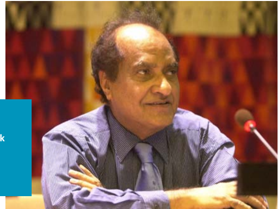
Dr. Nanak Kakwani

The CBMS is a community-based poverty monitoring system that began in the Philippines under the leadership of Dr. Celia Reyes of the Philippine Institute for Development Studies in the early 1990s and is now implemented in 14 countries in Asia and Africa. It is increasingly becoming an important tool to fighting poverty with facts. It is an organized way of collecting ongoing or recurring information by communities. Its core indicators are designed to capture multiple dimensions of poverty. The information collected is used by local governments, national governments, nongovernmental organizations and civil society for planning, budgeting,