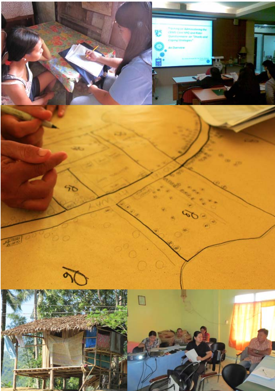
Above (from left to right): An enumerator surveys a household head in Poblacion III, Sto. Tomas, Batangas; the survey instrument on Coping Strategies is discussed to the enumerators in Batangas; Middle: Enumerators prepare the spotmap before data collection in Brgy. San Miguel, Llorente, Eastern Samar; Below (from left to right): A nipa hut in Barangay El Rio, Sibagat, Agusan del Sur; data collection training for enumerators in Agusan del Sur

The Community-Based Monitoring System (CBMS)-United Nations Development Programme (UNDP)-United Nations Children’s Fund (UNICEF) initiative on “Monitoring Household Coping Strategies during Complex Crises” began data collection in four sites in the Philippines last July 2011. Data collection in Barangay 192 in Pasay City kicked off on July 25, followed by Barangay San Miguel in Llorente, Eastern Samar and Barangay El Rio in Sibagat, Agusan del Sur on August 1, and Poblacion III in Sto. Tomas, Batangas on August 8.