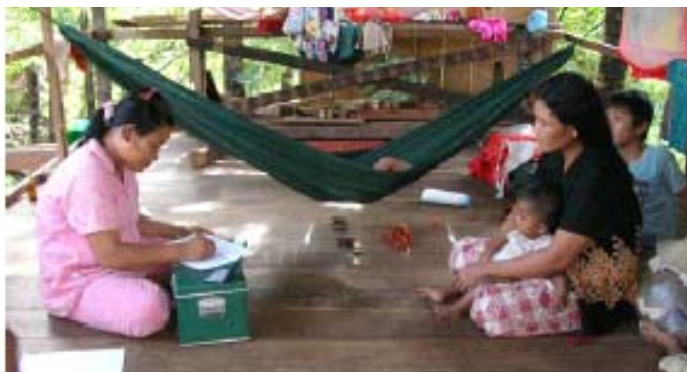
An enumerator interviews a household member during the pre-test of questionnaires in Stung District, Kampong Thum Province.